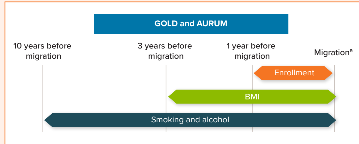
Figure 1. Evaluation Periods

<sup>a</sup> Practices' migration date (minimum = 26 March 2014, maximum = 15 July 2018).