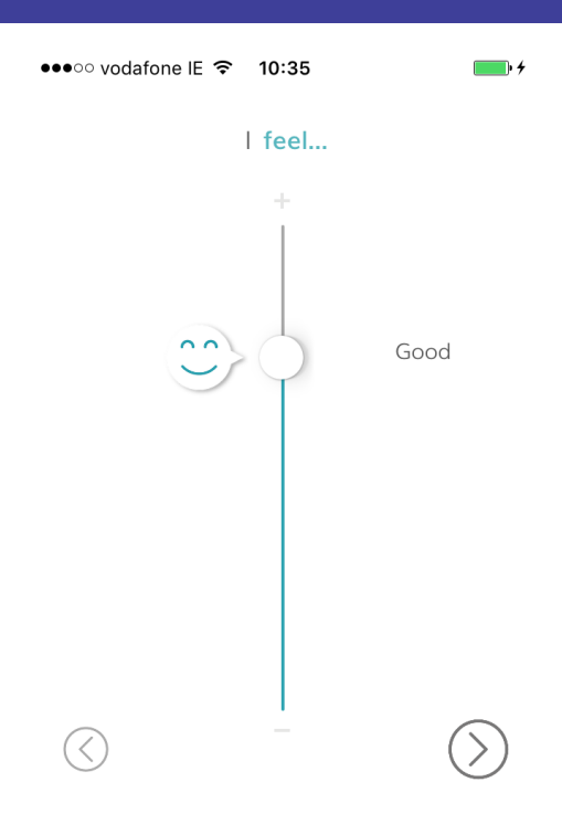
Figure 2 BrightSelf—Check In (screenshot).

notifications, however, will remain constant across participants for each type of notification.